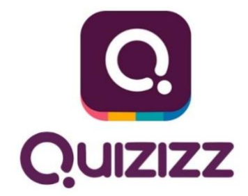
Figure 1. Quizizz application

Using the Quizizz application can help students become more involved in English learning material (Junior, 2020). It is proven that many students want to use the Quizizz application as an assessment tool in their future English classes (Bury, 2017). However, the obstacle to implementing the Quizzz application in learning is that there are still many teachers who do not understand the use of the Quizizz application, so they are reluctant or even unwilling to use the Quizizz application requires the use of a smartphone or computer, it will hinder student learning. The majority of schools in Indonesia prohibit students from bringing smartphones to school, while computer equipment in schools is sometimes inadequate.