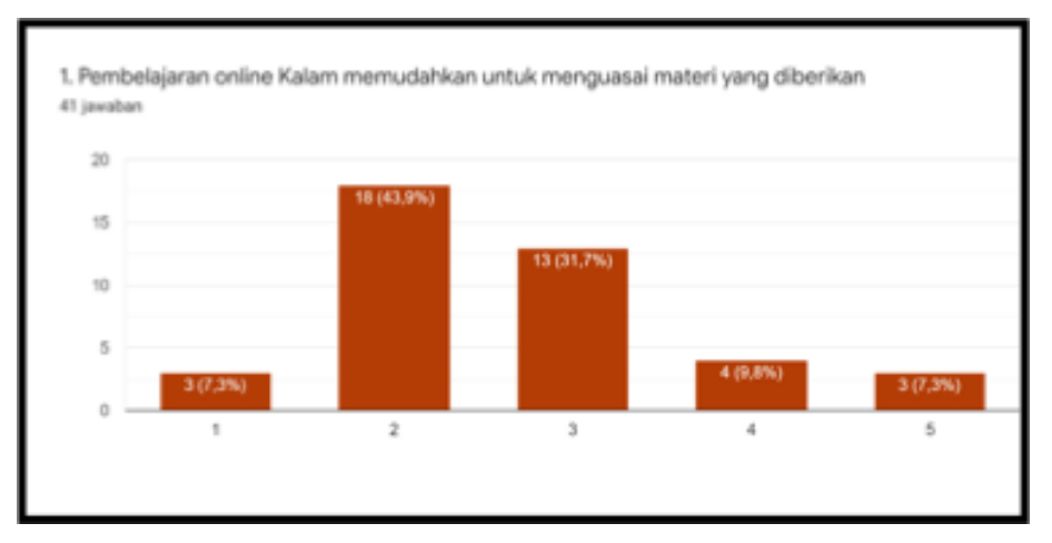
Picture1. Online learning Kalam makes it easy to master the material provided

Based on the results of research from 41 students, the data shows that 43.9% (18 students) of the students answer disagree if online learning Kalam made it easier to master the material provided and 31.7% (13 students) answer agree with the statement and 9.8% (4 students) said quite agree and 7.3% (3 students) answer strongly agree while only 7.3% (3 students) answer strongly disagree with the statement above. It means that online learning Kalam does not make it easier for students to master the material provided.